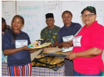
Presentation of some materials for the design of TLMs.