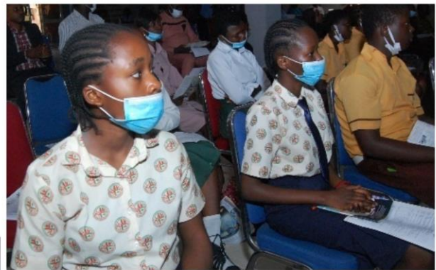
Cross Section of some students at the event