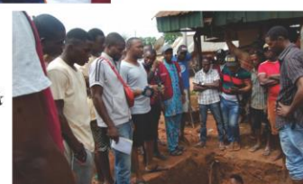
Inspection of work at the drain at Ujoelen junction