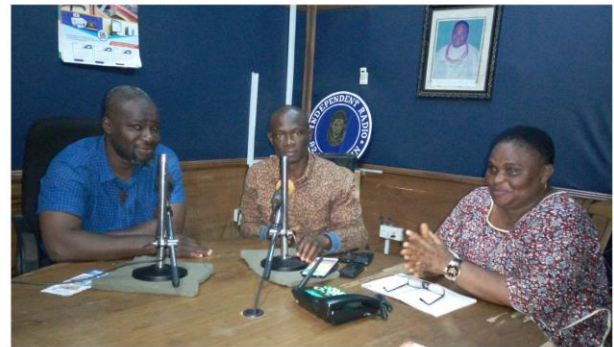
During a radio programme in ITV Radio Benin City.