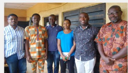
Group picture with CARITAS Nig Team after a visit to the Foundation's Office.