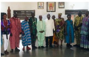
Condolence visit to two Board members