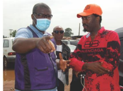
CRO interacting with the HOLGA

At the outbreak of Lassa Fever in Esan West LGA, the Local government council partnered with the Foundation