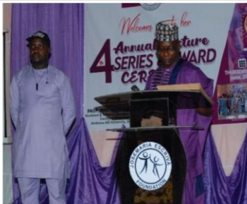
Board Chairman giving a speech