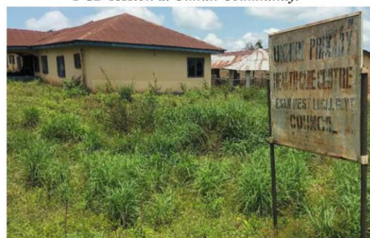
Ukhun PHC before intervention