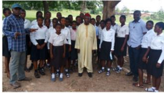
With the Principal Uma Sec. Commercial School, Imoga