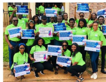
2022 Int. day for migrants

The Volunteers in the Foundation have continued to be an integral part of the Foundations activities. The Volunteers took turns to take part in different activities in the Foundation. The