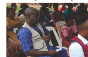
Group picture at the handover of the facility.