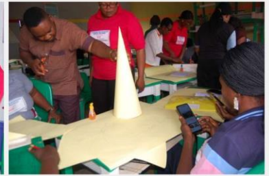
L-R: Practical session with Teachers