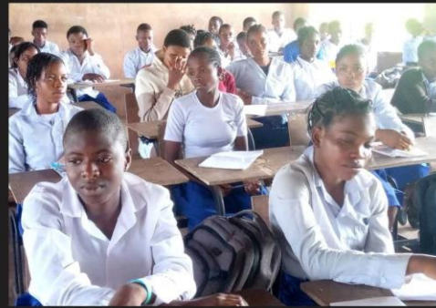
Students from Ebudin Secondary School Ebudin Esan Central LGA