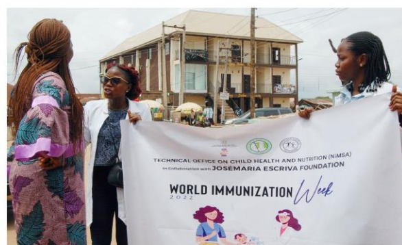
Scene from the street rally and sensitization in Ekpoma and environs