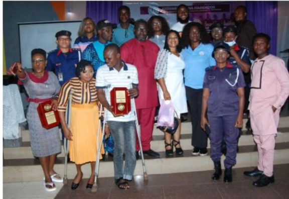
JOSEF Team and Some Awardees