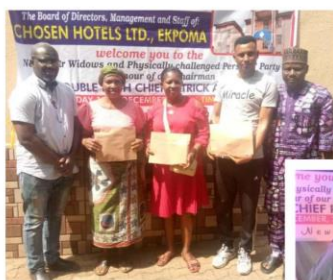
CRO with beneficiaries