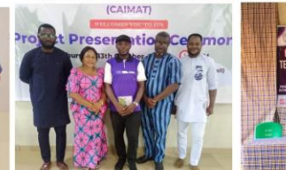
CRO with IDRC Team at CAIMAT Event