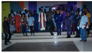
Group pictures after the 4th Annual Lecture of the Foundation