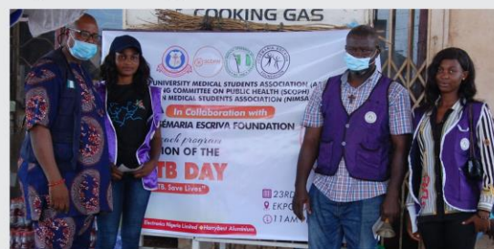
TB Sensitization, Screening and Demand Generation activities.