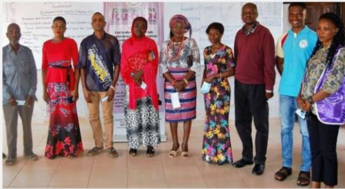
FGD with selected pupils.