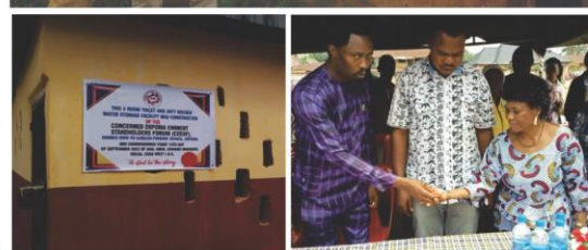
Scenes from the inauguration of the Toilet facility.