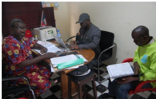
During an over-site visit by the State Focal person (wearing cap) to the Foundation's Office at Ekpoma.