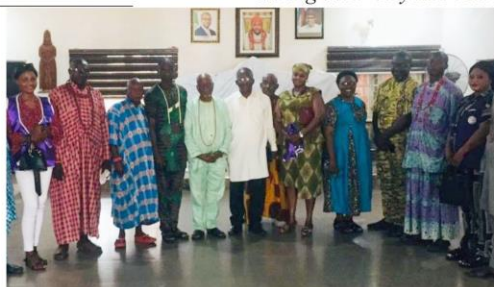
Condolence visit to a Board members, HRH, the Onojie of Ekpoma in the demise of the Queen Mother