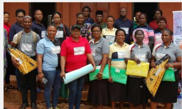
Group Picture with teaching aids courtesy TYDF