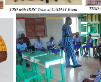
FGD with selected pupils.