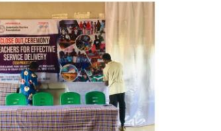
TESD Activities: Preparation for one of the events