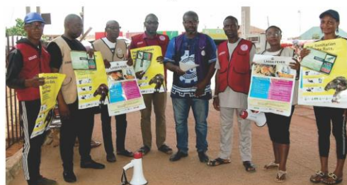
L-R: Group picture with CEESF JOSEF Team