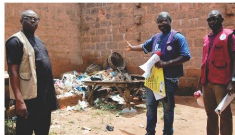
At one of the refuse dumps in Ekpoma market