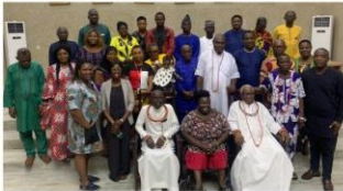
CARITAS Nig Strategic meeting in Benin