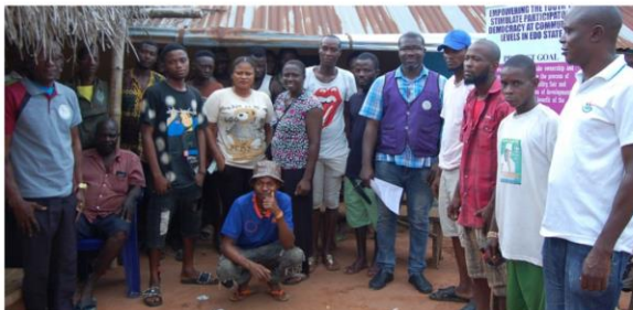
Session with community members at Egoro Amede.