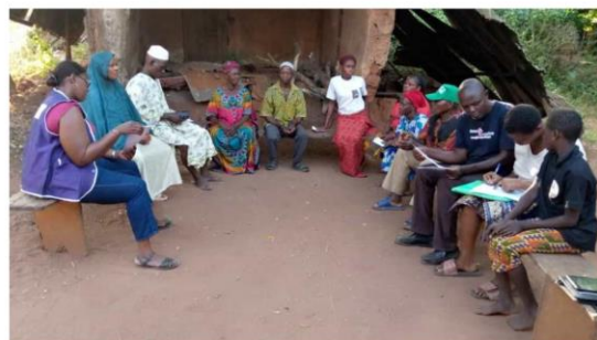
FGD session at Ukhun Community.