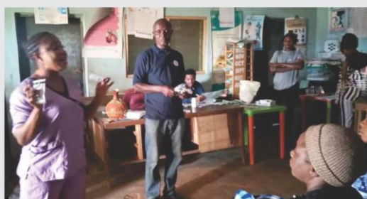
Inreach at Ujoelen PHC