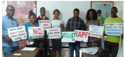
Group picture after a step-down training at the Foundation's office.