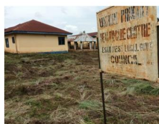
PHC After Intervention