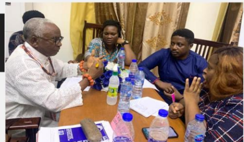
Group discussions at a training in Benin.