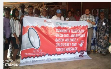
Outreach at Eben Community, Usen.