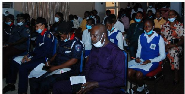
Cross Section of some guests