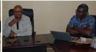
Presentation of an Award to the NUJ Chairman