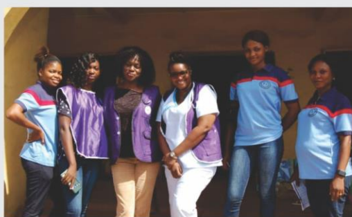
A paparazzi posture after an activity at a PHC