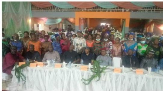
Group picture of participants.