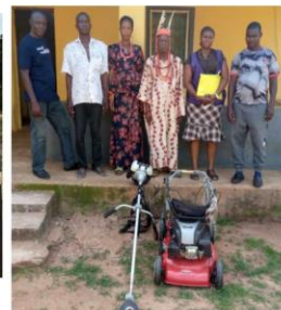
Presentation of the 2 mowers