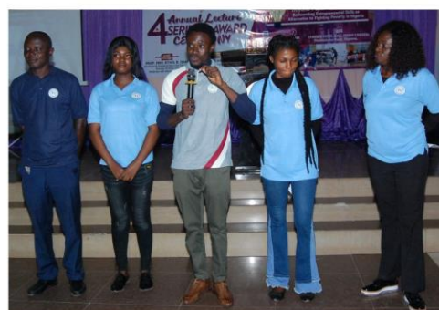
4th Annual Lecture Planning Comm. members