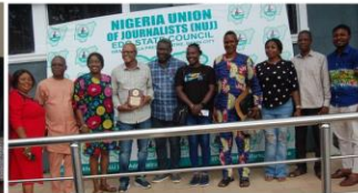
Group Picture with Some Journalists in Benin